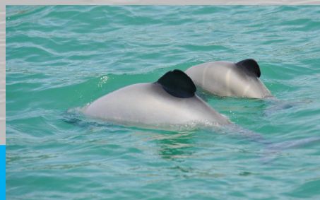
UNIQUE TO NEW ZEALAND