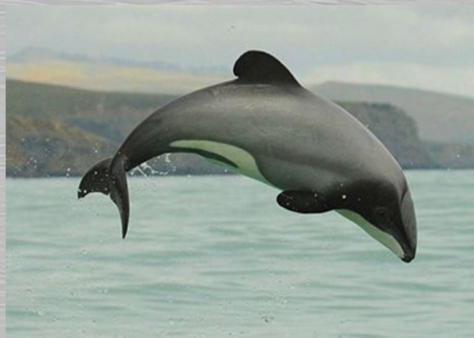
THE RAREST OCEAN DOLPHIN